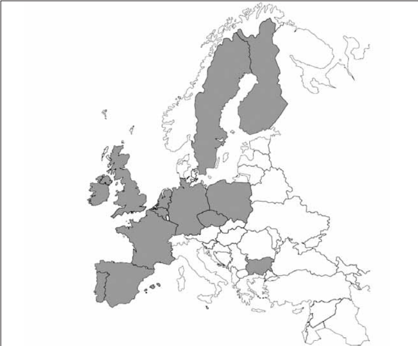
Map 3.1: The responding countries

A questionnaire was distributed to social housing experts in Belgium (Flanders), Bulgaria, the Czech Republic, Finland, France, Germany, Ireland, Netherlands, Poland, Portugal, Sweden, Spain and the UK (Map 3.1). Most of the experts were able to answer the questionnaire in English, but translation of the questionnaire and responses was undertaken where necessary. A list of the responding experts is presented in Appendix 1 .